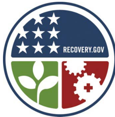
Energy Efficiency and Block Grant Program

Preparation of the Merced Climate Action Plan was financially supported by the Department of Energy under Award Number DE-SC0001848 to the City of Merced, California.